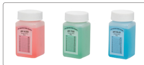
calibration solution (included)