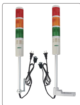
alarm light (optional)