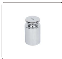
calibration weight (included in 8301-300, 8301-600 and 8301-1200)