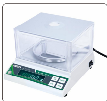
windshield (included in 8301-300, 8301-600 and 8301-1200)