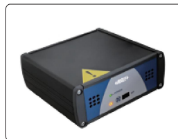
portable ioniser (optional)