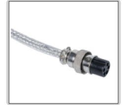
metal communication cable (included)