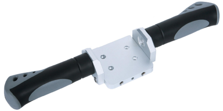
push test with single handle