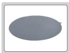
silicon carbide paper (included)