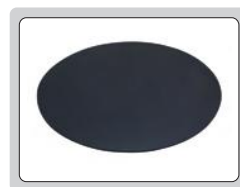
magnetic pad (included)