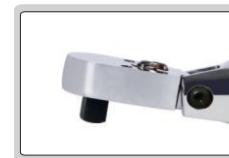
swing-head ratchet head