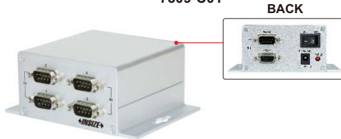
4-channel interface box 7107-1