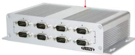
8-channel interface box 7107-2