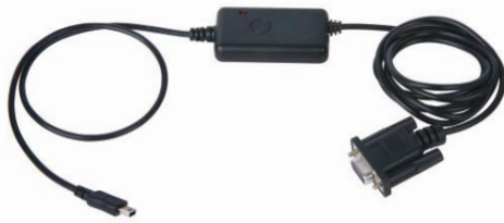
cable of digital indicator 7309-C01