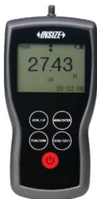
ISF-DF100A type A