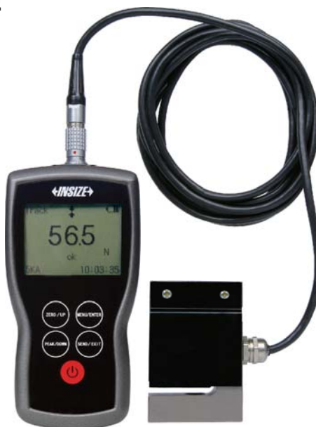
ISF-DF5KA type B