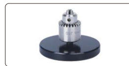
cylinder holder (included)