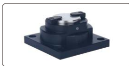
slice holder (included)