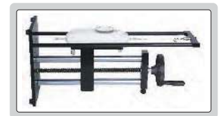
horizontal orientation test